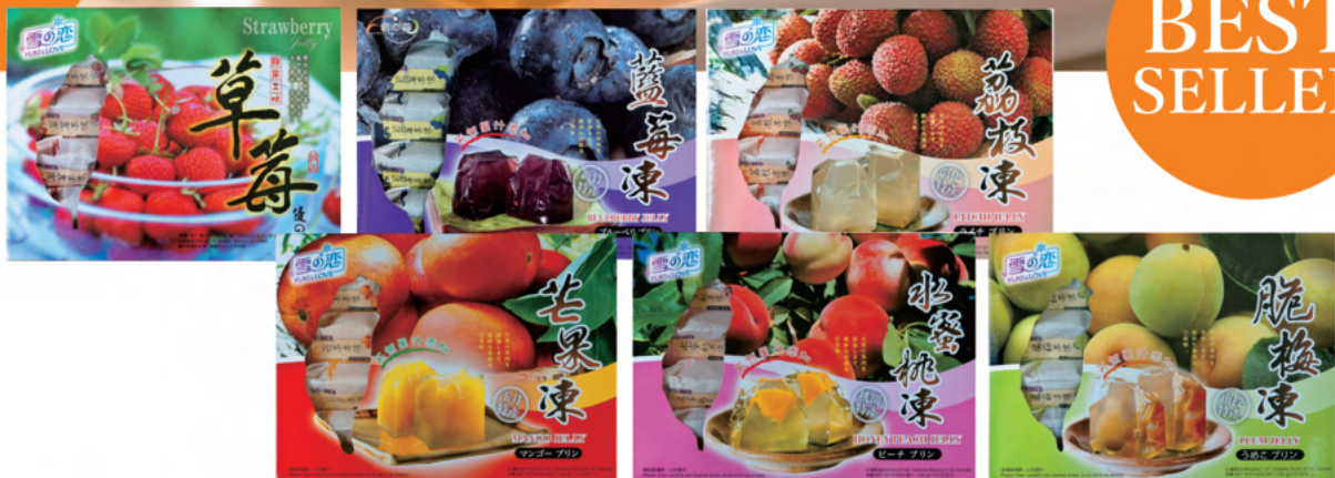
雪の戀 - 10入果凍(草莓、藍莓、荔枝、芒果、水蜜桃、脆梅) YUKI&LOVE FRUIT JELLY(STRAWBERRY · BLUEBERRY · LITCHI · MANGO · PEACH · PLUM) SPEC : 50G/10PCS 20BOXS/CTN