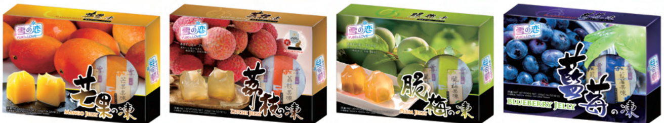
雪の戀 - 芒果的凍(芒果、荔枝、脆梅、藍莓) YUKI&LOVE FRUIT JELLY(MANGO · LITCHI · PLUM · BLUEBERRY) SPEC : 50G/4PCS 30BOXS/CTN