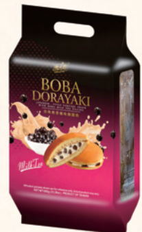
NEW 雪の戀 - 珍珠奶茶風味銅鑼燒 YUKI&LOVE BOBA MILK TEA FLAVOR DORAYAKI 規格: 55G/12入/12包/箱 SPEC: 55G/12PCS/ 12BAGS/CTN