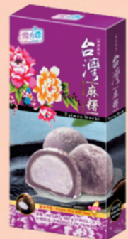
雪の戀 - 台灣客家麻糬(紫米芋頭) YUKI&LOVE TAIWAN HAKKA MOCHI (PURPLE RICE WITH TARO) 規格: 20G/10入/24盒/箱 SPEC: 20G/10PCS/24BOXES/CTN