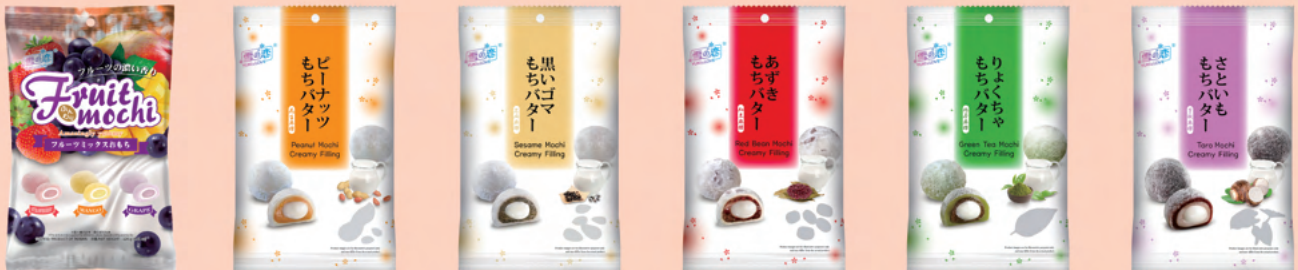
雪の戀 - 水果麻糬 (草莓、芒果、葡萄) YUKI&LOVE FRUIT MOCHI (MIXED) 規格: 14G/9入/24包/箱 SPEC: 14G/9PCS/24BAGS/CTN

規格: 35G/6入/24盒/箱 SPEC: 35G/6PCS/24BOXES/CTN