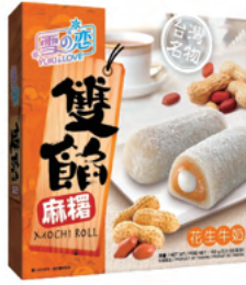
雪の戀 - 雙餡麻糬(花生) YUKI&LOVE MOCHI ROLL (PEANUT WITH MILK FLAVOR) 規格: 30G/10入/12盒/箱 SPEC: 30G/10PCS/ 12BOXES/CTN