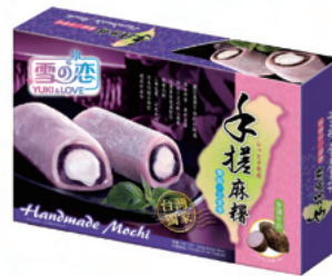
雪の戀 - 手搓麻糬(芋頭牛奶 / 綠茶牛奶 / 紅豆牛奶) YUKI&LOVE HANDMADE MOCHI (TARO WITH CREAMY FILLING / GREEN TEA WITH CREAMY FILLING / RED BEAN WITH CREAMY FILLING) 規格: 30G/5入/24盒/箱 SPEC: 30G/5PCS/24BOXES/CTN