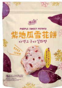
雪の戀 - 雪花餅 (紫地瓜雪花餅) YUKI&LOVE SNOWFLAKE CAKE (PURPLE SWEET POTATO) 規格: 12G/12入/20包/箱 SPEC: 12G/12PCS/ 20BAGS/CTN