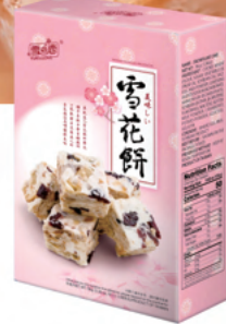
雪の戀 - 雪花餅 (蔓越莓口味) YUKI&LOVE SNOWFLAKE CAKE - CRAMBERRY 規格: 12G/8入/20包/箱 SPEC: 12G/8PCS/ 20BAGS/CTN