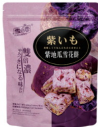
雪の戀 - 紫地瓜雪花餅 (紫地瓜口味) YUKI&LOVE SNOWFLAKE CAKE (PURPLE SWEET POTATO) 規格: 12G/9入/12包/箱 SPEC: 12G/9PCS/12BAGS/CTN