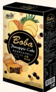
雪の戀 - 波霸珍珠酥 YUKI&LOVE BOBA PINEAPPLE CAKE 規格: 25G/8入/12盒/箱 SPEC: 25G/8PCS/12BOXES/CTN