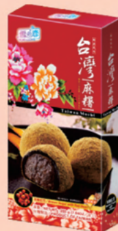
雪の戀 - 台灣客家麻糬(黑糖紅豆) YUKI&LOVE TAIWAN HAKKA MOCHI (BROWN SUGAR WITH RED BEAN FILLING) 規格: 20G/10入/24盒/箱 SPEC: 20G/10PCS/24BOXES/CTN