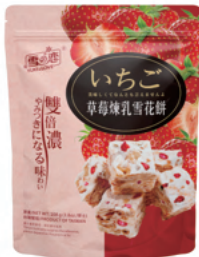
雪の戀 - 草莓煉乳雪花餅 (草莓口味) YUKI&LOVE SNOWFLAKE CAKE (STRAWBERRY & CONDENSED MILK) 規格: 12G/9入/12包/箱 SPEC: 12G/9PCS/12BAGS/CTN