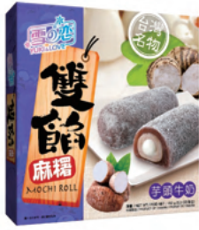
雪の戀 - 雙餡麻糬(芋頭) YUKI&LOVE MOCHI ROLL (TARO WITH MILK FLAVOR) 規格: 30G/10入/12盒/箱 SPEC: 30G/10PCS/ 12BOXES/CTN