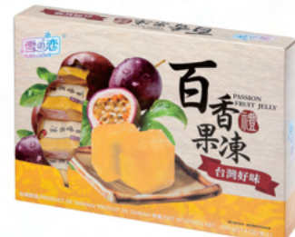
雪の戀 - 水果果凍(百香果) YUKI&LOVE JELLY (PASSION) SPEC : 50G/10PCS 20BOXS/CTN