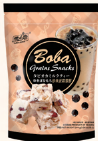
雪の戀 - 珍珠波霸雪餅 YUKI&LOVE BOBA MILK TEA GRAIN SNACKS 規格: 12G/12入/20包/箱 SPEC: 12G/12PCS/ 20BAGS/CTN