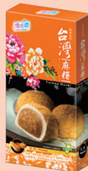
雪の戀 - 台灣客家麻糬(花生) YUKI&LOVE TAIWAN HAKKA MOCHI (PEANUT) 規格: 20G/10入/24盒/箱 SPEC: 20G/10PCS/24BOXES/CTN