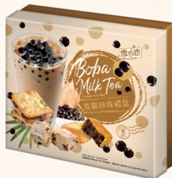
雪の戀 - 波霸珍奶禮盒 YUKI&LOVE BOBA MILK TEA COOKIES GIFT BOX 規格: 312G/10盒/箱 SPEC: 312G/10BOXES/CTN