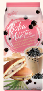
雪の戀 - 珍珠奶茶風味銅鑼燒 YUKI&LOVE DORAYAKI (BOBA MILK TEA FLAVOR) 規格: 55G/3入/12包/箱 SPEC: 55G/3PCS/12BAGS/CTN