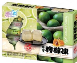
雪の戀 - 水果果凍(蜂蜜檸檬) YUKI&LOVE JELLY (HONEY-LEMON) SPEC : 50G/10PCS 20BOXS/CTN