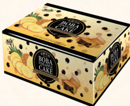
雪の戀 - 波霸珍奶風味酥 YUKI&LOVE BOBA PINEAPPLE CAKE 規格: 25G/16入/12盒/箱 SPEC: 25G/16PCS/12BOXES/CTN