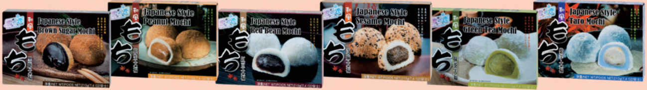
雪の戀 - 和風麻糬 (黑糖、花生、紅豆、芝麻、綠茶、芋頭) YUKI&LOVE JAPANESE STYLE MOCHI (BROWN SUGAR · PEANUT · RED BEAN · SESAME · GREEN TEA · TARO)

規格: 35G/4入/24盒/箱 SPEC: 35G/4PCS/24BOXES/CTN