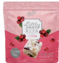
雪の戀 - 隨手茶點 一口雪花酥(蔓越莓) YUKI&LOVE SNOWFLAKE CAKE (CRANBERRY) 規格: 12G/5入/20包/箱 SPEC: 12G/5PCS/20BAGS/CTN