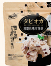
雪の戀 - 波霸珍珠雪花餅 YUKI&LOVE SNOWFLAKE CAKE (BOBA MILK TEA FLAVOR) 規格: 12G/9入/12包/箱 SPEC: 12G/9PCS/ 12BAGS/CTN