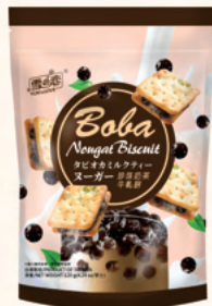
雪の戀 - 珍珠奶茶牛軋餅 YUKI&LOVE BOBA NOUGAT BISCUIT 規格: 15G/8入/20包/箱 SPEC: 15G/8PCS/ 20BAGS/CTN