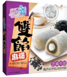
雪の戀 - 雙餡麻糬(芝麻) YUKI&LOVE MOCHI ROLL (SESAME WITH MILK FLAVOR) 規格: 30G/10入/12盒/箱 SPEC: 30G/10PCS/ 12BOXES/CTN