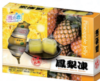
雪の戀 - 水果果凍(鳳梨) YUKI&LOVE JELLY (PINEAPPLE) SPEC : 50G/10PCS 20BOXS/CTN