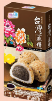
雪の戀 - 台灣客家麻糬(芝麻) YUKI&LOVE TAIWAN HAKKA MOCHI (SESAME) 規格: 20G/10入/24盒/箱 SPEC: 20G/10PCS/24BOXES/CTN