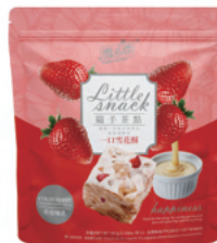
雪の戀 - 隨手茶點 一口雪花酥(草莓煉乳) YUKI&LOVE SNOWFLAKE CAKE (STRAWBERRY & CONDENSED MILK) 規格: 12G/5入/20包/箱 SPEC: 12G/5PCS/20BAGS/CTN