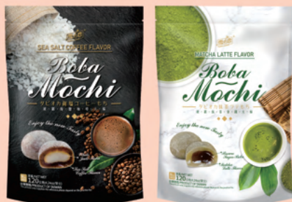
NEW 雪の戀 - 波霸大福 (咖啡海鹽風味 / 抹茶拿鐵風味) YUKI&LOVE BOBA MOCHI (SEA SALT COFFEE FLAVOR / MATCHA LATTE FLAVOR) 規格: 15G/8入/24包/箱 SPEC: 15G/8PCS/24BAGS/CTN