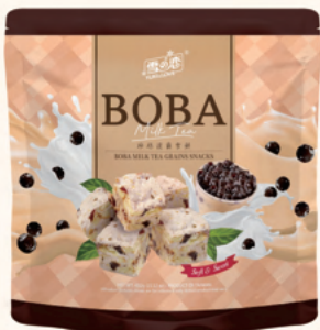
雪の戀 - 波霸珍珠雪餅 YUKI&LOVE BOBA MILK TEA SNOWFLAKE CAKE 規格: 12G/36入/11包/箱 SPEC: 12G/36PCS/ 11BAGS/CTN