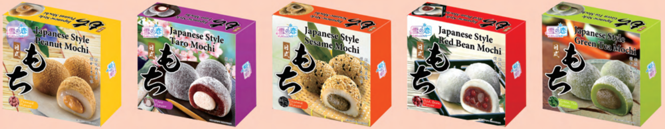
雪の戀 - 日式麻糬 (花生、芋頭、芝麻、紅豆、綠茶) YUKI&LOVE MOCHI (PEANUT · TARO · SESAME · RED BEAN · GREEN TEA)

規格: 35G/4入/24盒/箱 SPEC: 35G/4PCS/24BOXES/CTN