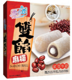
雪の戀 - 雙餡麻糬(紅豆) YUKI&LOVE MOCHI ROLL (RED BEAN WITH MILK FLAVOR) 規格: 30G/10入/12盒/箱 SPEC: 30G/10PCS/ 12BOXES/CTN