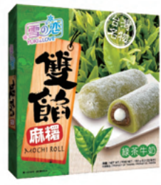
雪の戀 - 雙餡麻糬(綠茶) YUKI&LOVE MOCHI ROLL (GREEN TEA WITH MILK FLAVOR) 規格: 30G/10入/12盒/箱 SPEC: 30G/10PCS/ 12BOXES/CTN