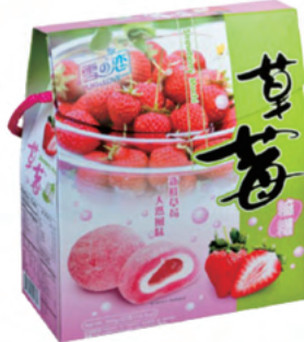
雪の戀 - 手提小麻糬(榴槤、荔枝、草莓) YUKI&LOVE MOCHI- (DURIAN FLAVOR / LITCHI FLAVOR / STRAWBERRY FLAVOR) 規格: 300G/10盒/箱 SPEC: 300G/10BOXES/CTN