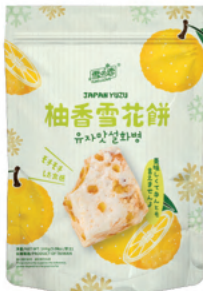
雪の戀 - 雪花餅 (柚香風味) YUKI&LOVE SNOWFLAKE CAKE (POMELO FLAVOR) 規格: 12G/12入/20包/箱 SPEC: 12G/12PCS/ 20BAGS/CTN