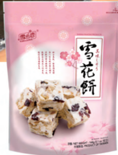
雪の戀 - 雪花餅 (蔓越莓口味) YUKI&LOVE SNOWFLAKE CAKE - CRAMBERRY 規格: 12G/12入/20包/箱 SPEC: 12G/12PCS/ 20BAGS/CTN