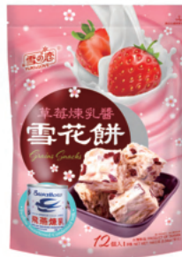
雪の戀 - 雪花餅 (草莓煉乳雪花餅) YUKI&LOVE SNOWFLAKE CAKE (STRAWBERRY & CONDENSED MILK) 規格: 12G/12入/20包/箱 SPEC: 12G/12PCS/ 20BAGS/CTN