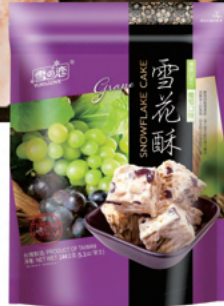
雪の戀 - 葡萄雪花餅 (葡萄口味) YUKI&LOVE SNOWFLAKE CAKE (GRAPE) 規格: 12G/12入/20包/箱 SPEC: 12G/12PCS/ 20BAGS/CTN