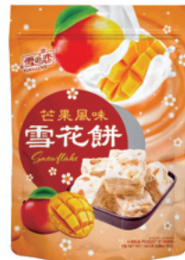
雪の戀 - 雪花餅 (芒果雪花餅) YUKI&LOVE SNOWFLAKE CAKE (MANGO) 規格: 12G/12入/20包/箱 SPEC: 12G/12PCS/ 20BAGS/CTN